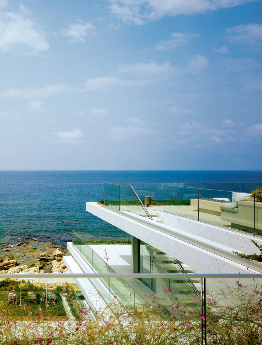
Left: Standing on the central roof bridge with unimpeded views to the sea and overlooking the pool garden below. Below: Villa entrance: Guided from the parking towards the central courtyard by water features.