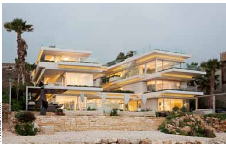
Large windows offer unimpeded views of the sea