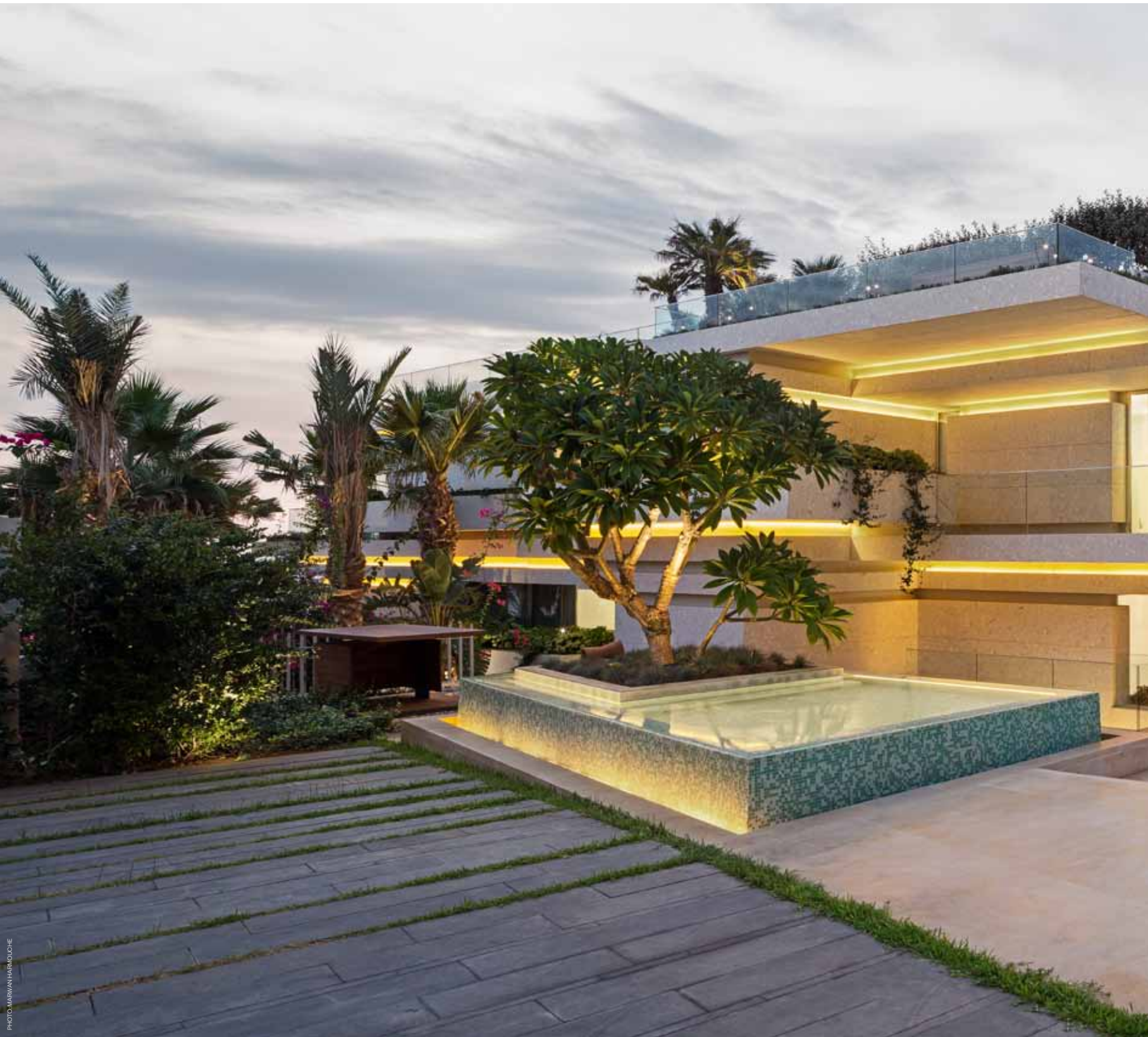
The entrance area includes water features that lead the way towards the sea