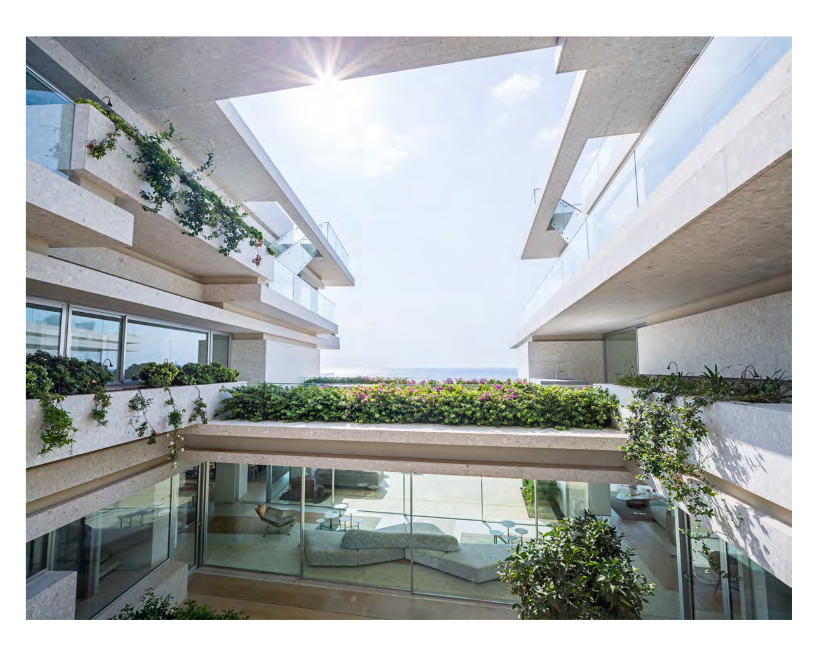
f am interested in architectural representation and process and always emphasize the role of the designer as a passionate, engaged and responsible individual